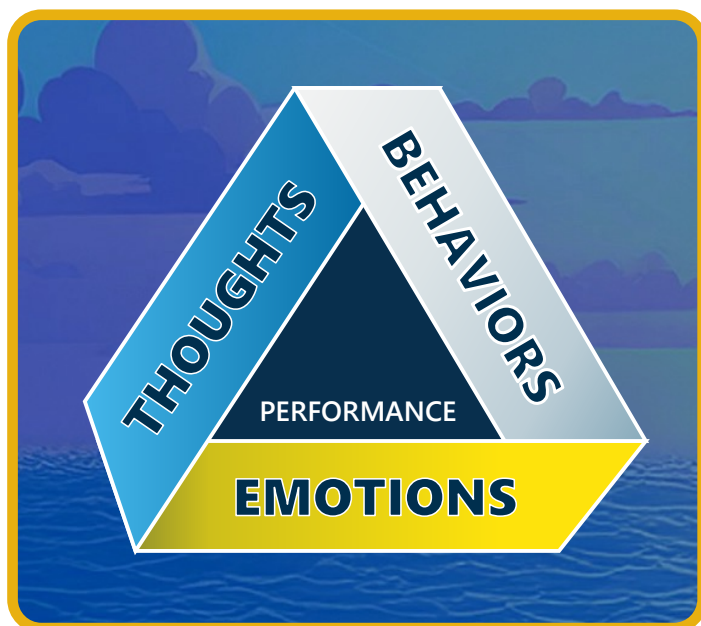
Self-Talk Model with sea and horizon in background

The key to altering the loop is awareness of patterns and associations between thoughts, emotions, and behaviors.