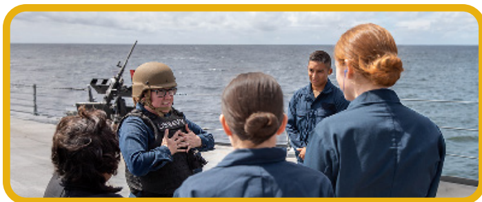
Sailors training at sea