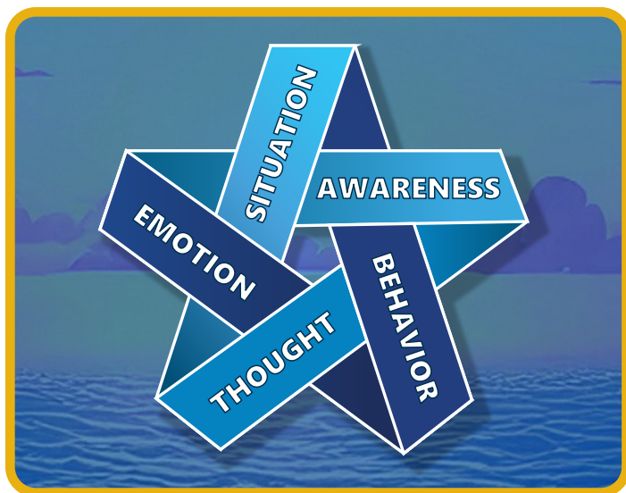
Feedback loop with sea and horizon in background

The mind and body can be thought of as part of a loop. It begins with a situation, something happening in the environment. Most situations are outside an individual's direct control, but behavior can still influence how they unfold. From there, thoughts emerge. These are the beliefs or interpretations attached to what just happened, and they shape not only how a person feels but also how they respond.